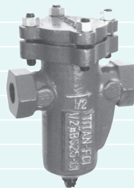
Full ANSI Rated Bolted Cover

Ideal Design for Applications Where Easy Maintenance and Large Capacity are Required