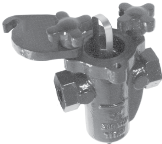
Knob Type/Quick Opening Cover (Quick-open cover is standard)