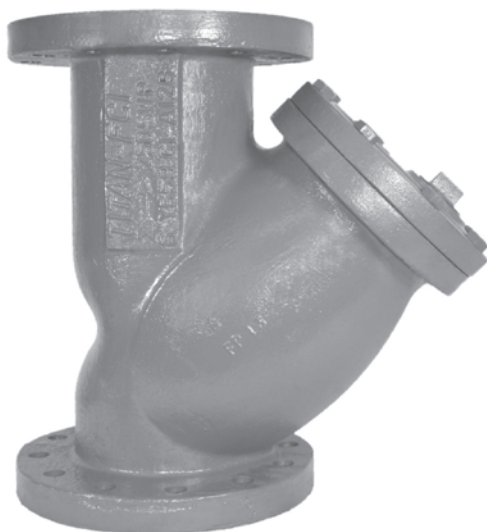
6" YS 59-CI